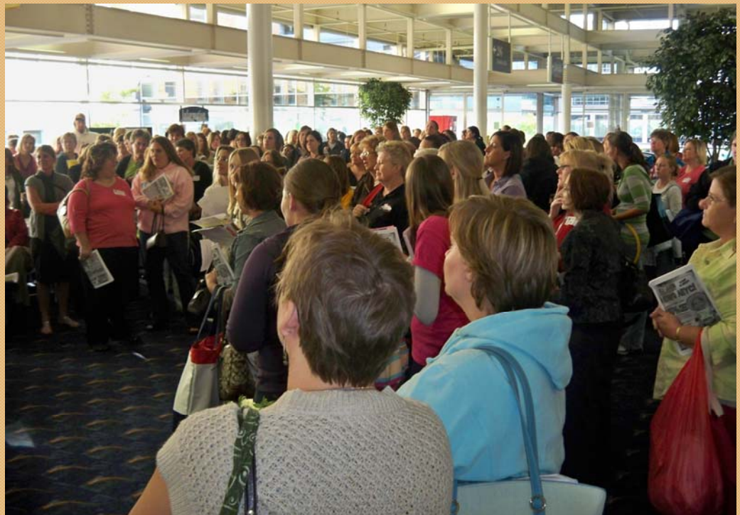
Conference attendees anxiously await the door prize drawing.