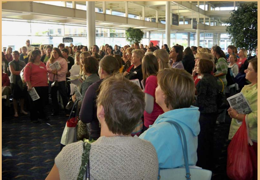
Conference attendees anxiously await the door prize drawing.