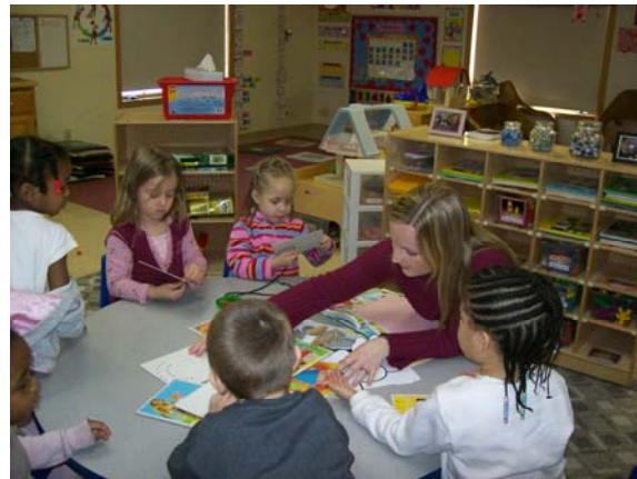
Taken at Scott County Family Y Palmer Center. The center participates in the Quality through Accreditation project.

From assessment, each program is given a consultant—called a mentor—to help take the assessment findings and turn them into a quality facilitation plan. Mentors visit each program monthly aiding in the quality facilitation process. In addition, each participating program has training experiences at a designated demonstration center and monthly cohort meetings. Other quality facilitation supports include help with the Quality Rating Scale, training using the ECERS-R and ITERS-R for self-assessment (Iowa only), national accreditation support for interested centers, and director membership in the National Association for the Education of Young Children.