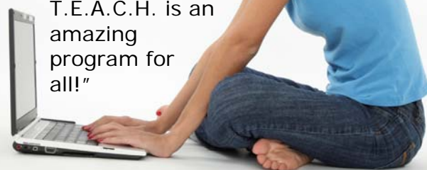
Child care provider

T.E.A.C.H. is an amazing program for all!"